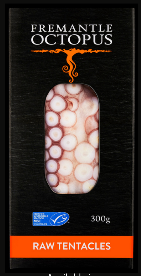
Available in Cartons of 14 x 300g (Shelf-ready)

"Experience Culinary Brilliance: Indulge in the Finest Raw Fremantle Octopus Tentacles, Crafted for Food Enthusiasts Everywhere. Sourced from around the world and cherished by connoisseurs, our tentacles are carefully selected by our experts. Enjoy their natural tenderness, preserved through our exclusive snap-freezing technique."