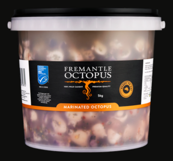
Available in Cartons of 2 x 5kg Tubs

"Irresistibly Luxurious: Savor the Sumptuousness of our Bite-Sized Octopus Medallions. Impeccably steamed and infused with a harmonious blend of mild chili, garlic, fragrant herbs, and spices, they are a true culinary delight."