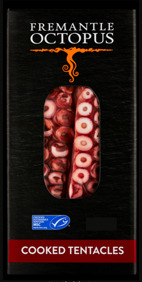
Available in Cartons of 14 x 200g (Shelf-Ready)

"Creating Culinary Delight: Our Sous Vide-Cooked Octopus is a Chef's Dream, expertly prepared for your Perfection. Elevate your dishes with unmatched tenderness and flavor, sourced responsibly to enhance your culinary adventures. Turn your culinary dreams into reality—place your order today."