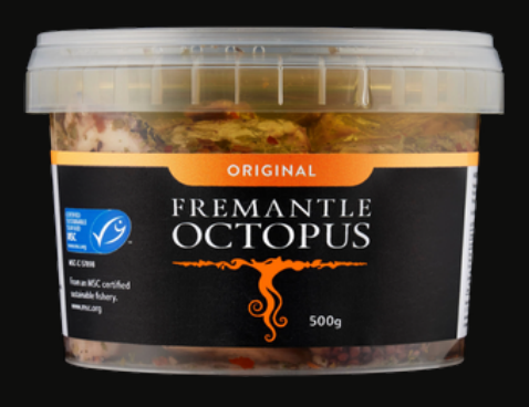
Available in Cartons of 6 x 500g Jars