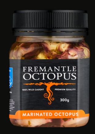
Available in Cartons of 6 x 300g Jars