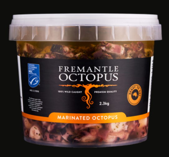
Available in Cartons of 4 x 2.3kg Tubs