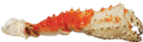
③ Killer Claw

Packed: 10 lb Carton L (4 oz up) M (2-4 oz) S (under 2 oz)