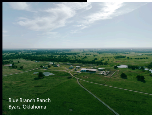
Blue Branch Ranch Byars, Oklahoma